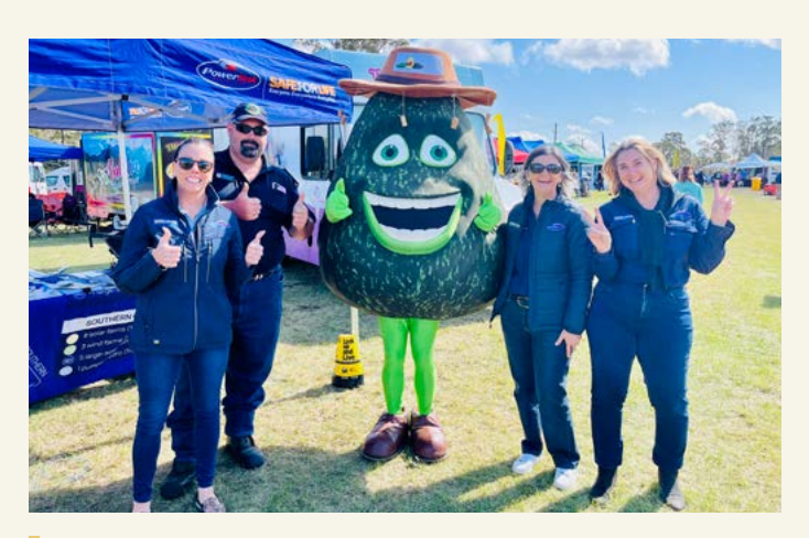
Powerlink team members were at the Blackbutt AvoFest to talk with the community about our projects in the region.