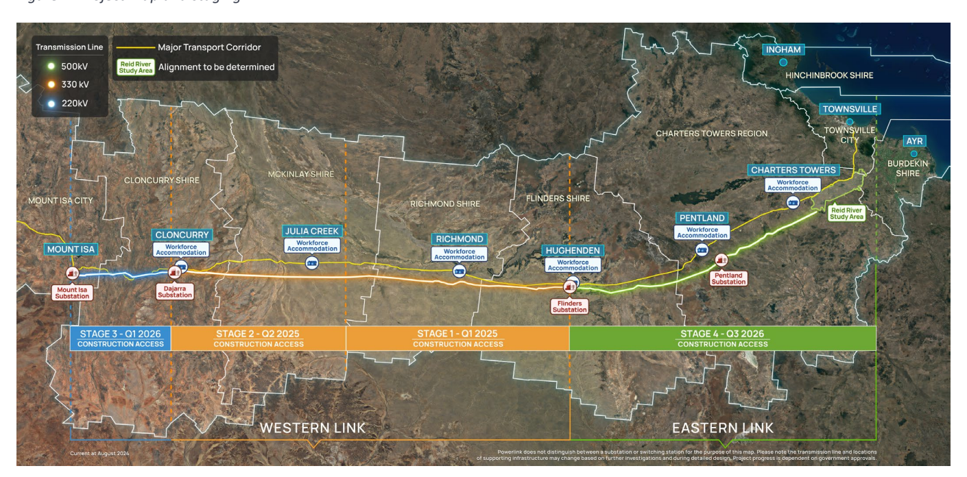
Figure 1: Project map and staging